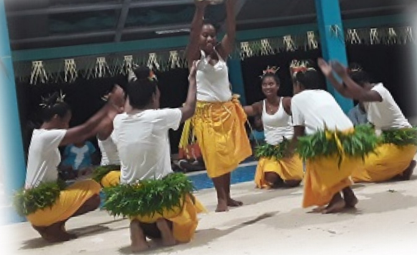
Diamond Jubilee cake dance at Wagina

The pilgrimage journey of the paschal Candle and