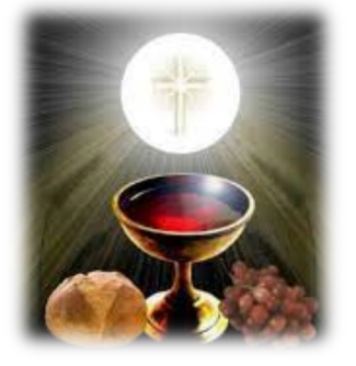
SACRED HEART OF JESUS, JUNE 11